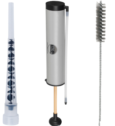
T-Flow Nozzles Blow-out Pump Cleaning Brush