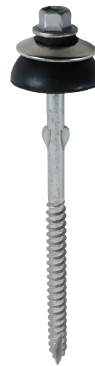
Slash Point - For Timber

Used for securing fibre cement profile sheets to light section steel (max. 5mm). Complete with heavy duty EPDM and stainless steel washer to provide a water-tight seal. Also known as a BAZ washer.