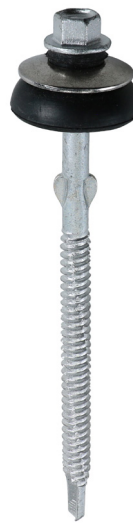
Self-Drilling - For Light Section Steel