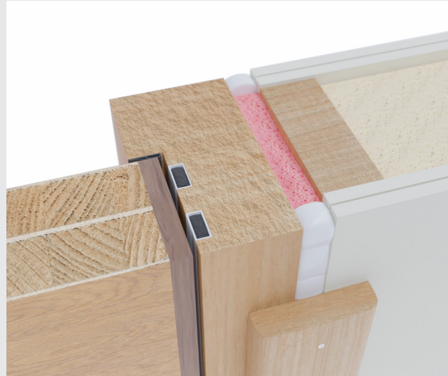
FAS Fire Door Silicone Sealant with FAS Fire Door Foam™ for joint widths up to 30mm to achieve fire ratings of up to 60 minutes when applied correctly.