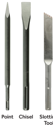
Point Chisel Slotting Tool