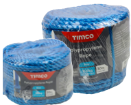
Short & Long Coil