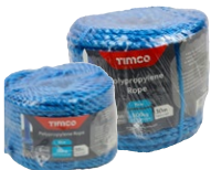
Short & Long Coil