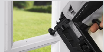
Second Fix Applications