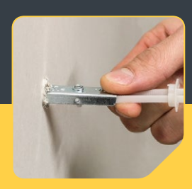
Ensuring the thumb tab faces upwards, insert the metal toggle through the hole, so it pivots down behind the substrate.