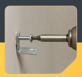
Insert a M6 screw through the fixture and into the threaded part of Zip-Fix and tighten until secure.