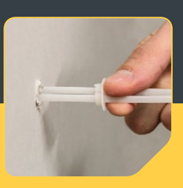
Zip the nylon collar towards the wall so the collar sits into the drilled hole. Then snap off the nylon arms.