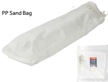
PP Sand Bag