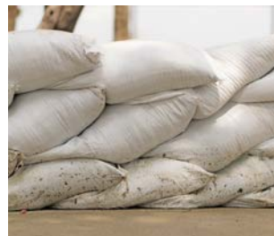
Hessian Sand Bag